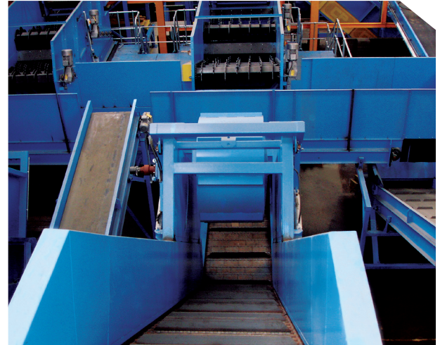
Heavy-duty rotating drum